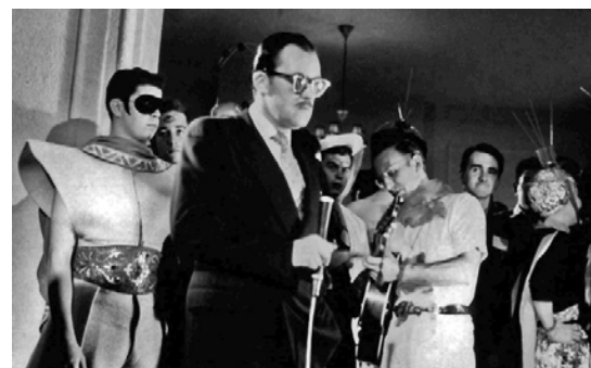
Alan Whicker and masqueraders