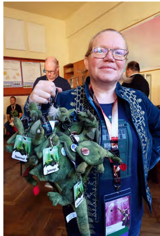
Dragon Plushies at Polcon